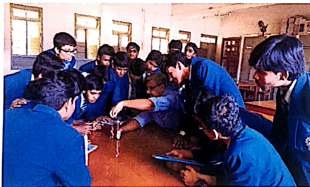
Students Watching Human Heart