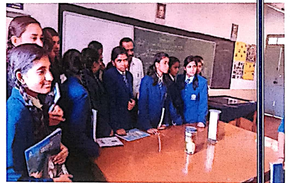
Students Watching Aborted Human Embryo

Report: The exhibition was organized for Central School Students on 4 November 2016. Nearly 100 students visited the exhibition. Department staff members and BSc students explained information about fascinating animals like habit, habitat, taxonomy, morphology and behaviour animals.