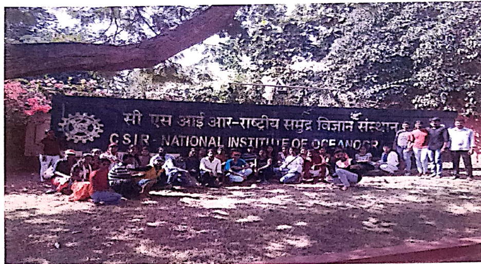
Visited CSIR- National Institute of Oceanography, Dona Paula, Goa on 24 Feb 2018