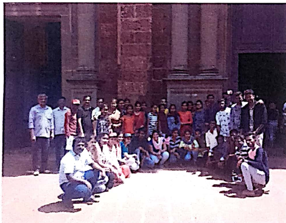
Visited Church in Goa on 25 Feb 2018