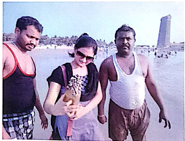
Balanus Specimens Collected From Murudeshwara