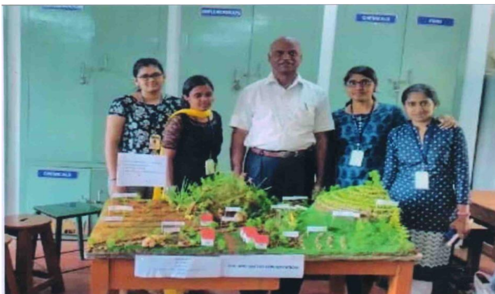
National Science Day 2017-18 III BSC students won First Prize in University-Level Science Exhibition Model on soil conservation and rain water harvest.